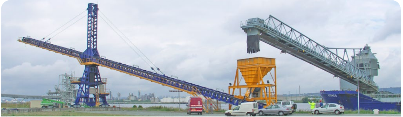
Stacker belt conveyor